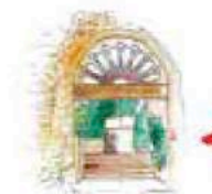
LA FIERMONTINA LUXURY HOME Lecce