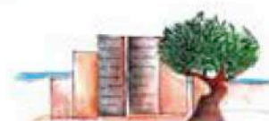
LA FIERMONTINA OCEAN Larache