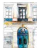
LA FIERMONTINA VENDÔME Paris