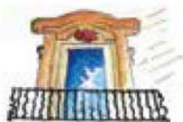
LA FIERMONTINA PALAZZO BOZZI CORSO Lecce