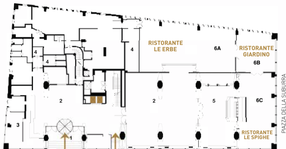
INGRESSO MAIN ENTRANCE GROUND FLOOR VIA CAVOUR