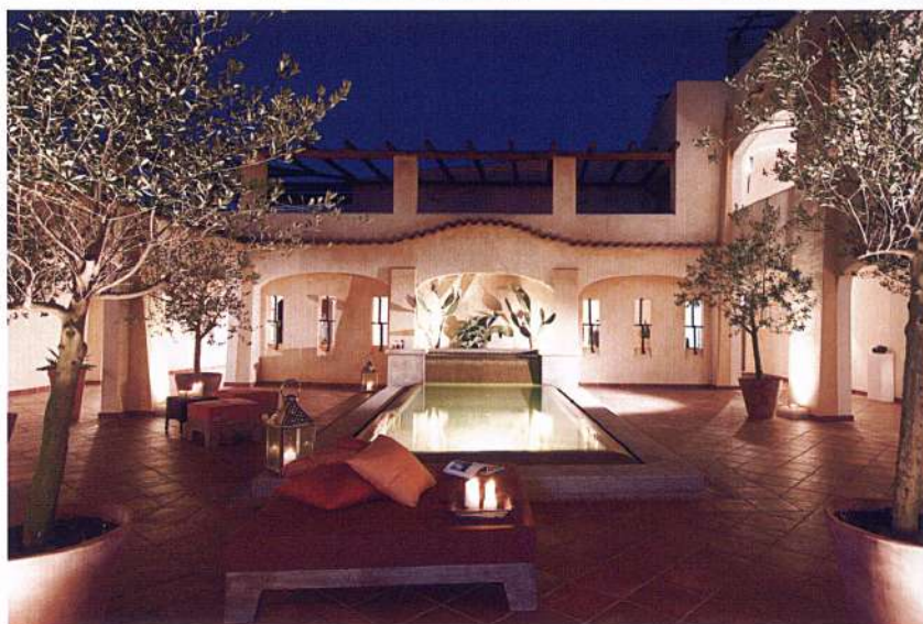
ABOVE: The resort is magnificently appointed for discerning guests.