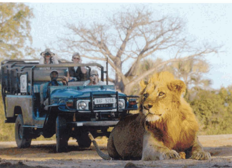
Above: the pioneering Chiawa Camp in Zambia celebrates its 20th anniversary. Below: Antony Gormley's Critical Mass II on show at Kunsthau in Bregenz, Austria.