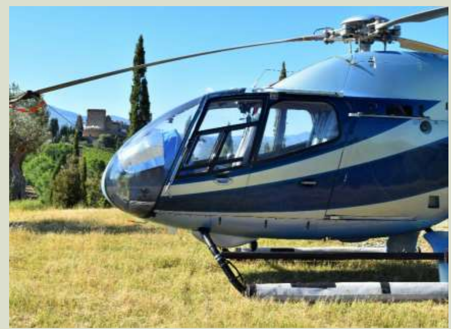
HELICOPTER TOURS HELIPAD FOR ARRIVALS AND DEPARTURES