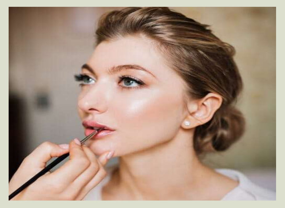
BRIDAL BEAUTY SERVICES