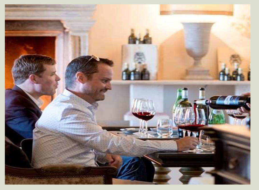
WINE & OIL TASTING PRIVATE DINING