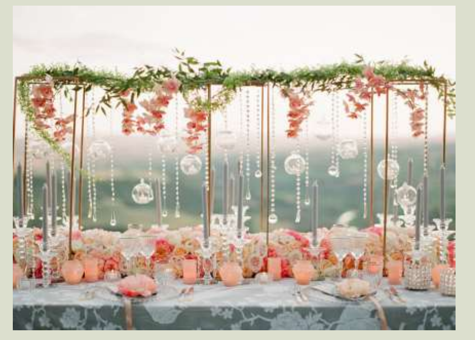
FLORAL AND DECOR SERVICES