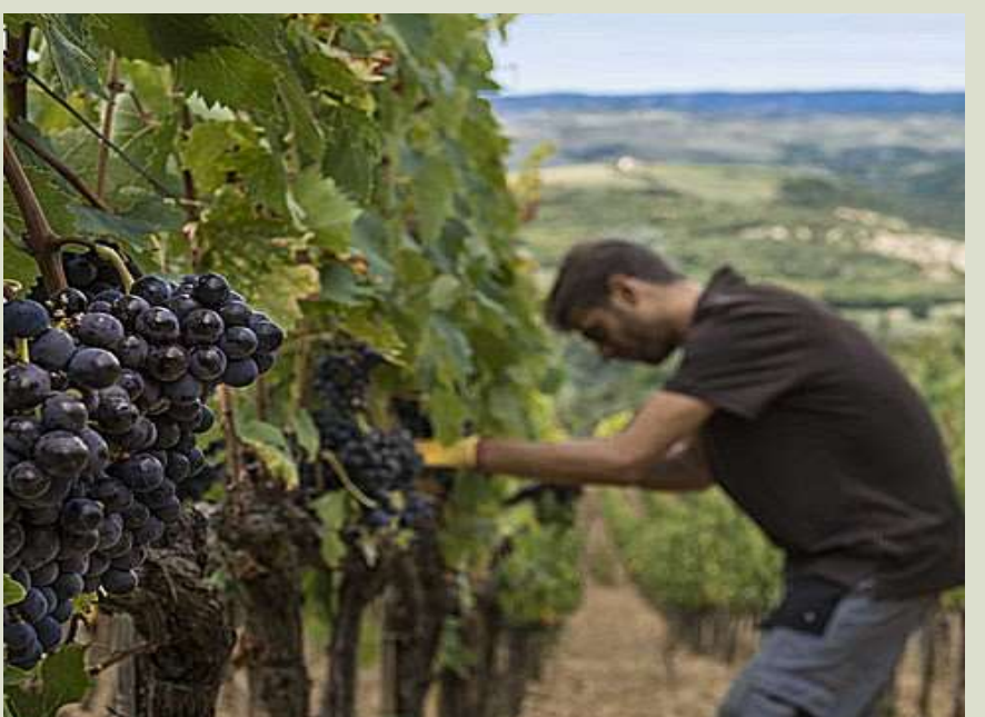
BRUNELLO HARVEST – PICNIC IN THE VINEYARDS – COOKING CLASSES