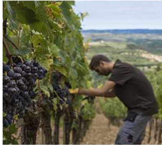
Brunello Harvest Picnic in the vineyards Cooking Classes