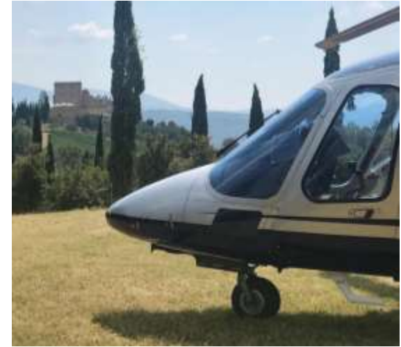
Helicopter Tours Helipad for arrivals and departures