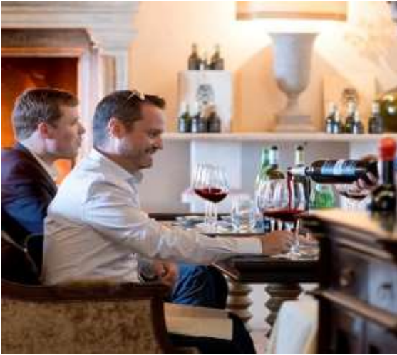
Wine & Oil Tasting Private Dining