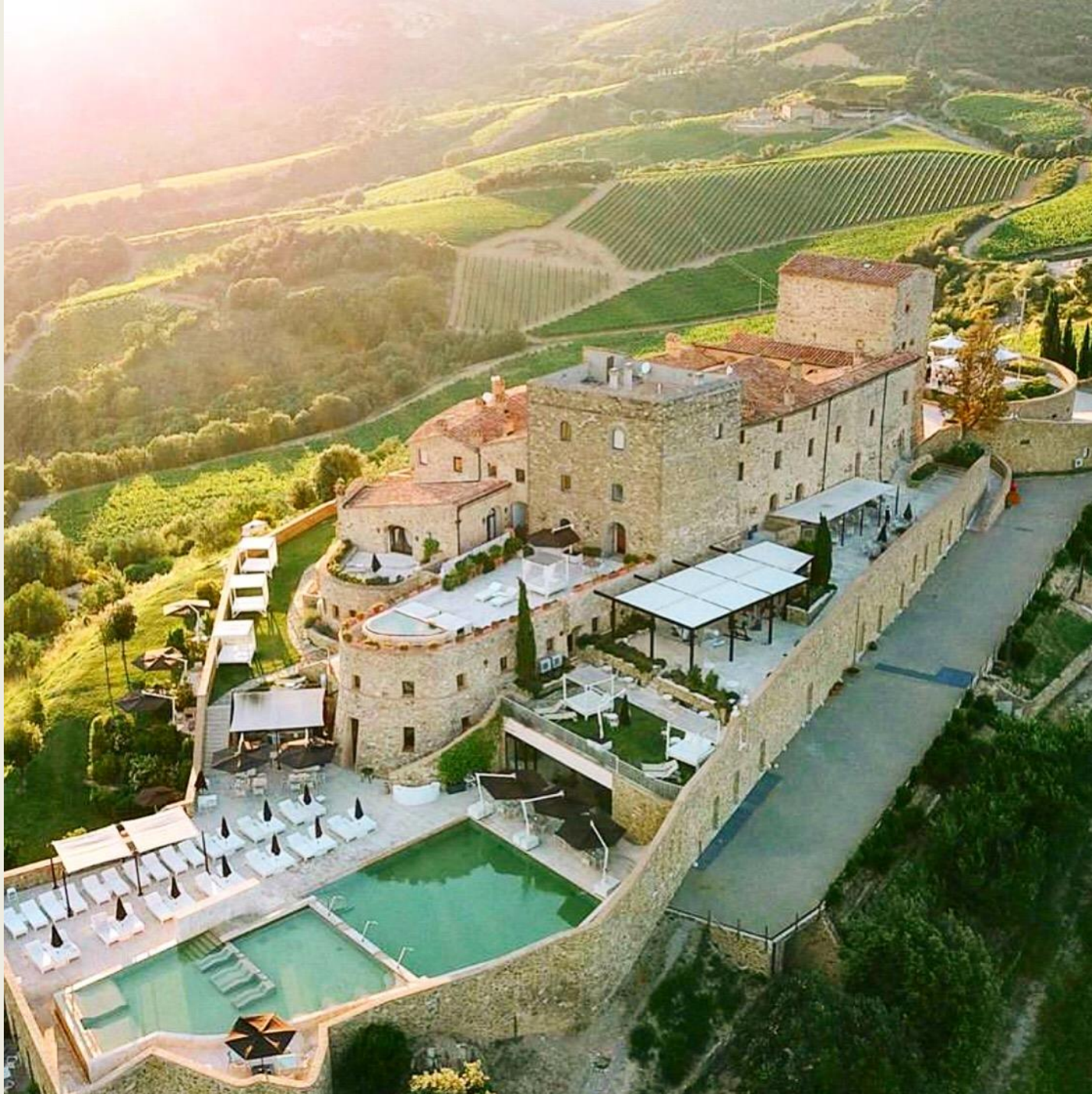
Castello di Velona is set on a hilltop in the Southern tip of Montalcino (Siena) with a 360° view over our Brunello vineyards. It is the ONLY Castle in the World with its Natural Thermal Water, coming from its own hot spring on site and it is situated in Val d'Orcia, a UNESCO World Heritage