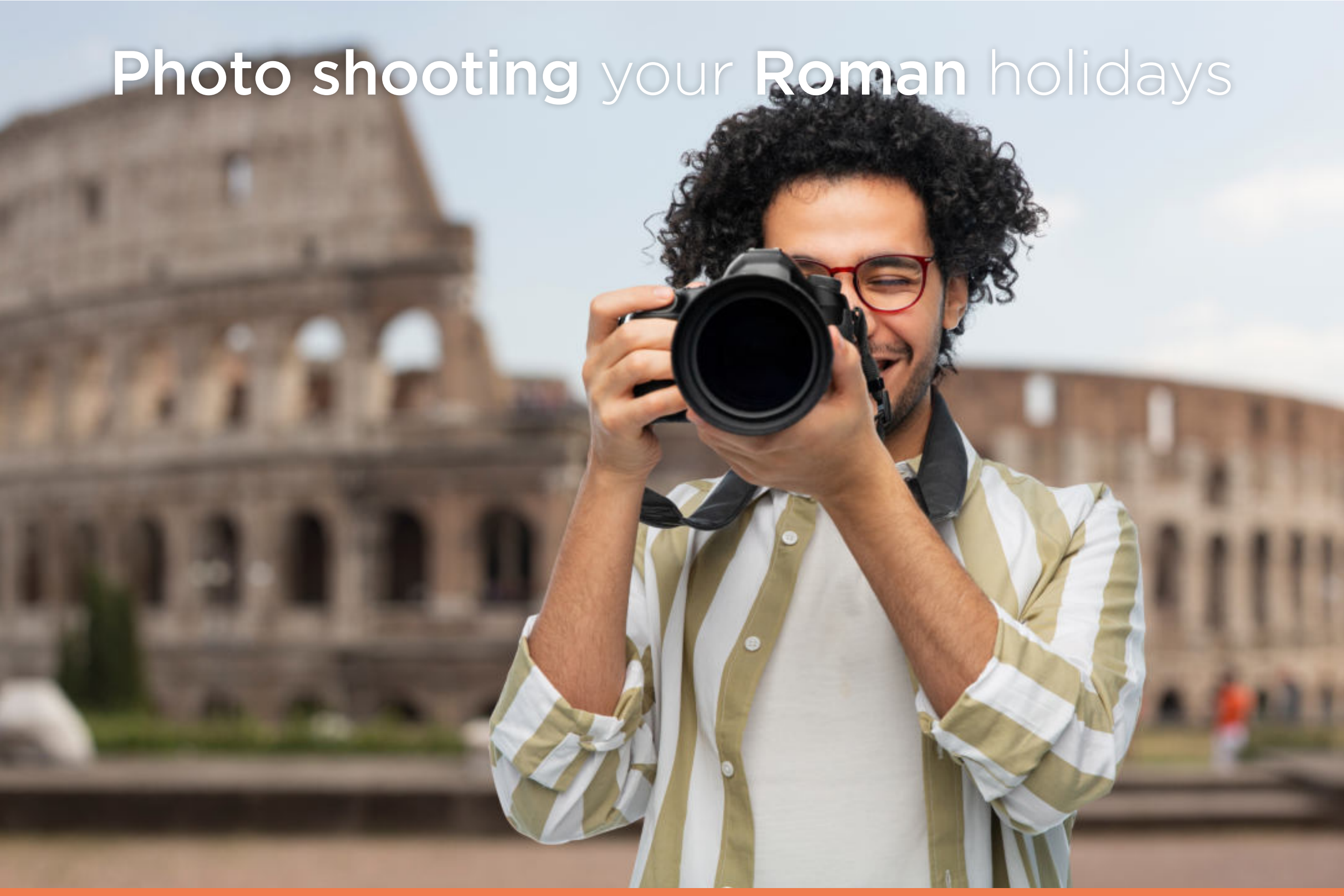
Photo shooting your Roman holidays