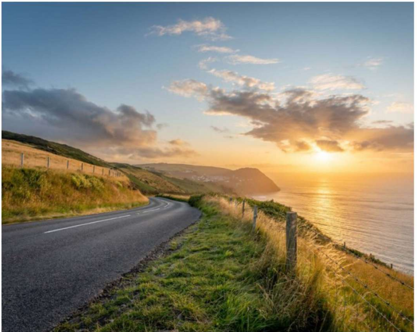
The South West 660 (See :Working with the Alliance)