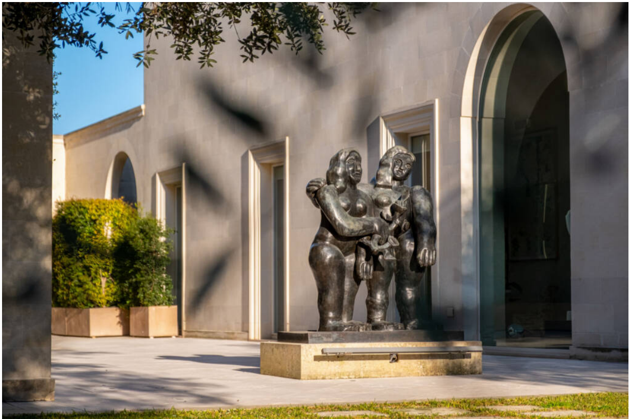
The artworks around La Fiermontina Luxury Home are part of the carefully selected collection, and the architecture tells a story of the family's ancestors and the country's history