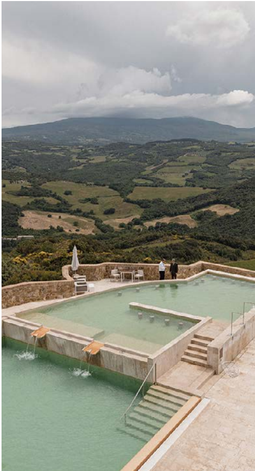
SPA & Thermal Waters