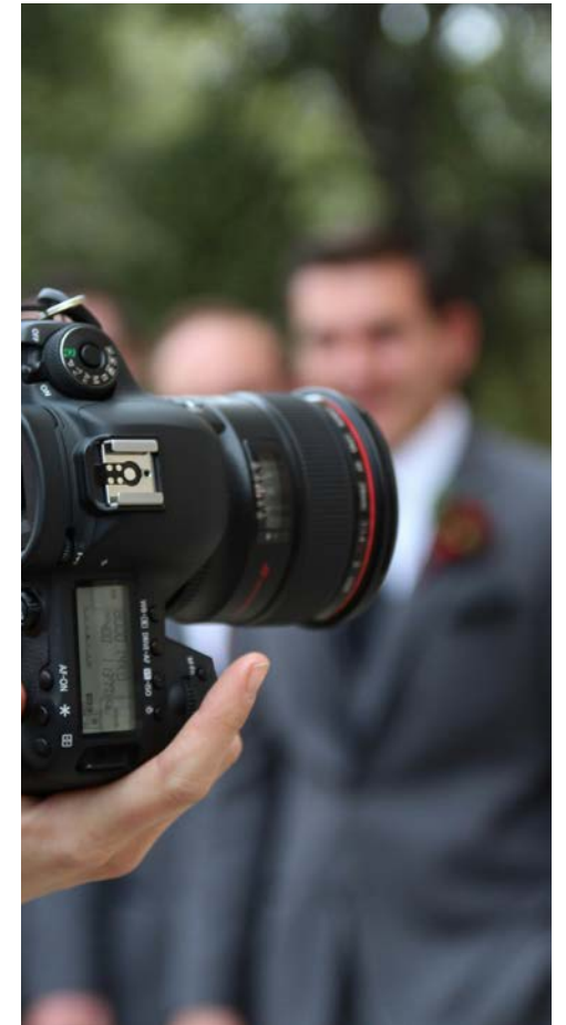
Photo and Video Services