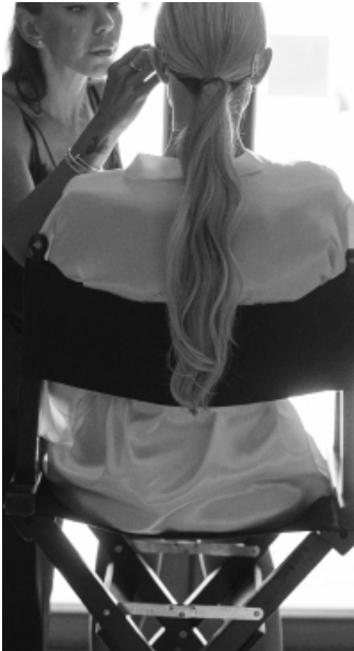
Hair and Make-Up