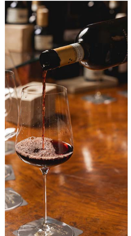
Incredible Tuscan Experiences