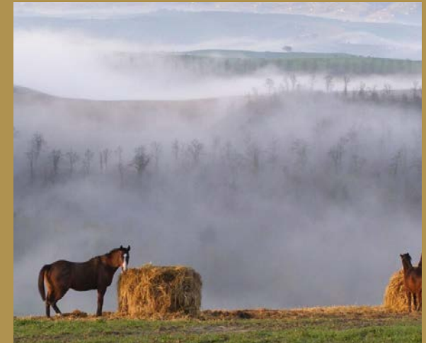
OUTDOORS ACTIVITIES Horseback riding - Biking - Hiking - Gym