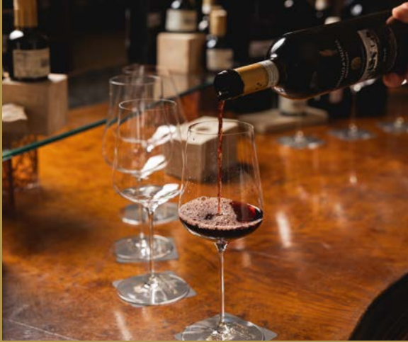
WINE AND OIL TASTING PRIVATE DINING