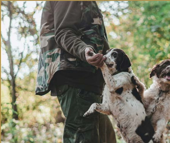
TRUFFLE HUNTING COOKING CLASSES