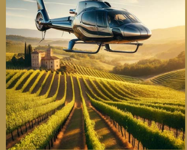
HELICOPTER TOUR HELIPAD AT THE CASTLE