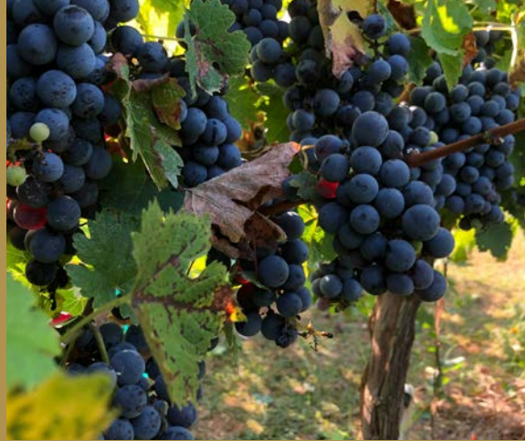
BRUNELLO HARVEST PICNIC IN THE VINEYARDS