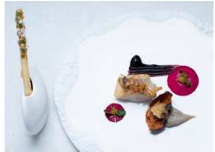
Some dishes created by Pasquale Palamaro for Indaco.