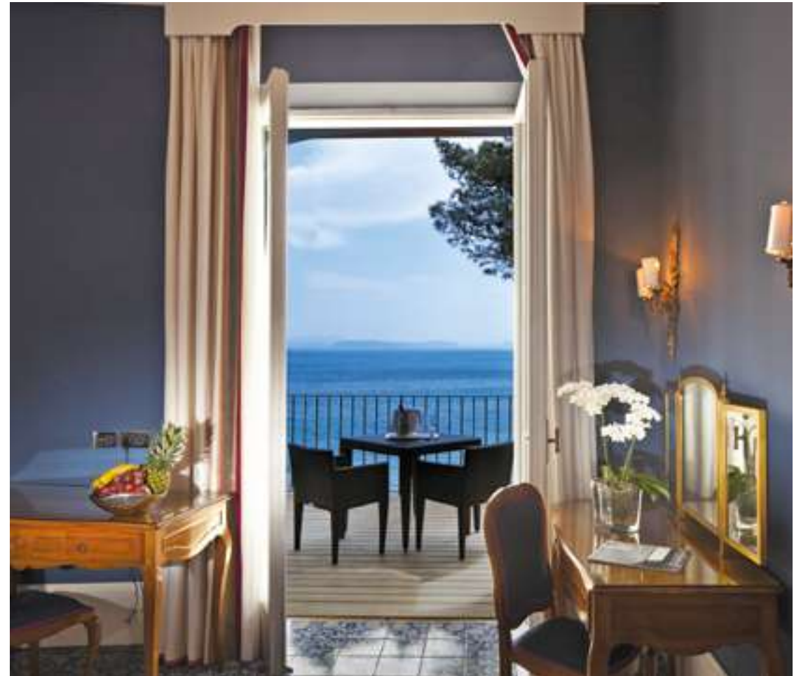
One of the 27 Luxury Accommodations overlooking the sea.